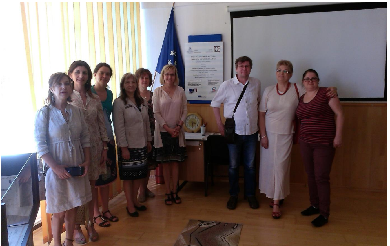
Second meeting of the partners in Onesti, Romania, June 2015

All partners presented their researches/analyses about unemployment and entrepreneurship approaches, as well as best practices of entrepreneurship teaching in their countries. We worked on the finalization of the three teaching modules and discussed further details of the Trainer Workshop in Iceland. We were also introduced to the methods practiced in Romania. We established the next steps to be taken in the project, and we allocated further tasks to be accomplished.